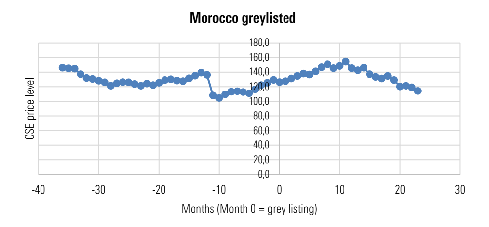
Data as at 31/01/2023. For illustrative purposes only.

In the case of Botswana, one could be tempted to conclude that equities indeed respond to a greylisting, however, as can be seen from the Moroccan example not so much. Besides that, one would have to isolate the effect of greylisting from other risk-off events. For example, the drawdown exhibited 11 months before Morocco was greylisted was due to Covid. Once again this is too small a sample to draw any meaningful conclusions from.